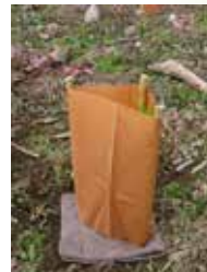
E. Slide CombiGuard sleeve over first 3 canes and seedling.