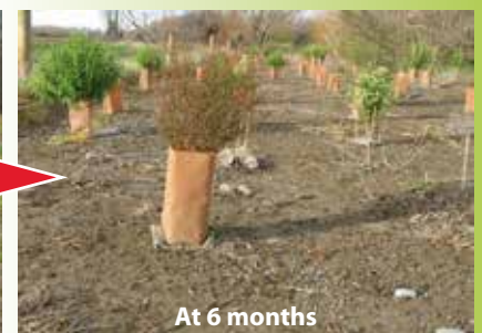
At 6 months