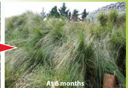
At 6 months