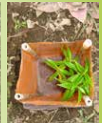
G. View from the top of the installed CombiGuard.