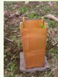
F. Insert 4th cane into sleeve, pushing through final corner slot and tensioning guard.