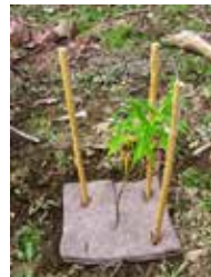
D. Firmly push first 3 canes through corner slots into soil approx. 200mm (8").