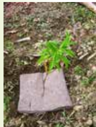
C. Fold mat over positioning stem inside second slot.