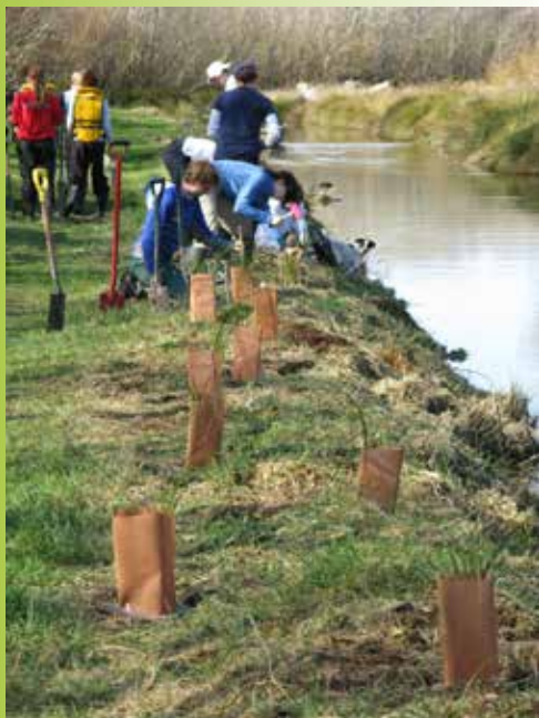
A team of enthusiastic native planters using CombiGuards®