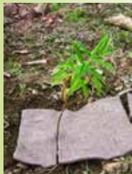
B. Position mat with seedling stem inside slot.