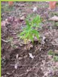
A. Plant your seedling.