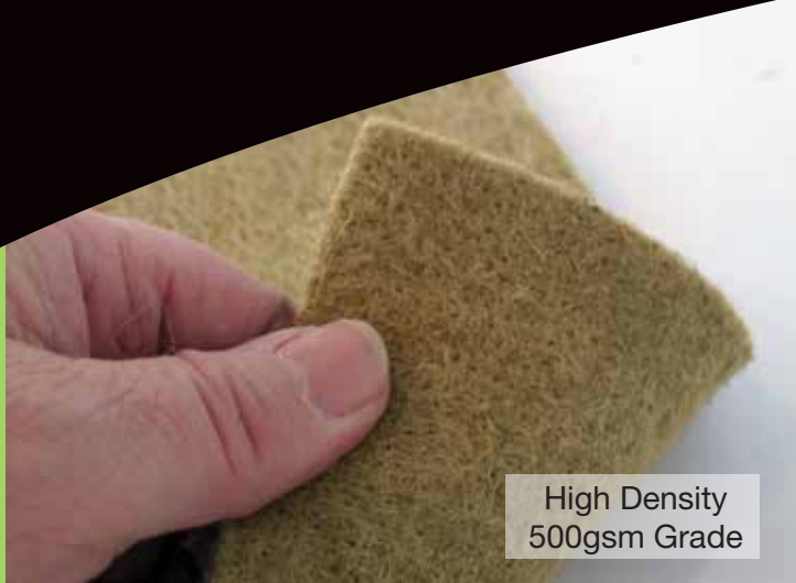
High Density 500gsm Grade