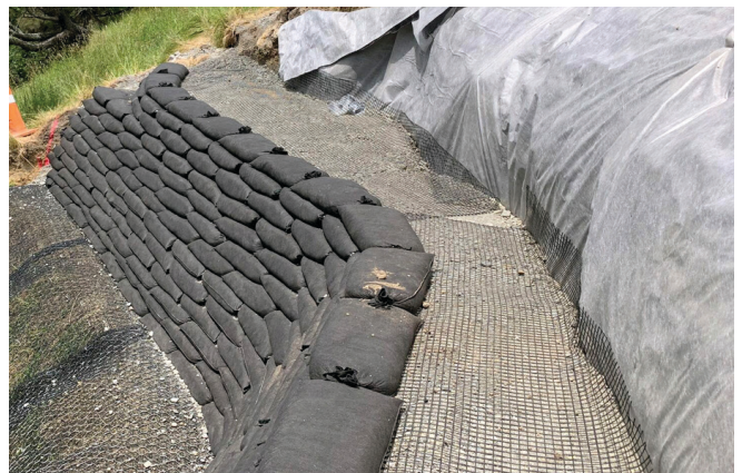
ACEGrid is suitable for use in the design of the Flex MSE Vegetated Wall System.